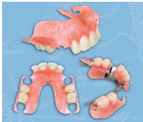
Valplast is softer, more comfortable, and stronger than typical acrylics used in partial dentures.

Valplast exhibits 26% greater softness than the acrylics used on typical metal partials. Valplast is more comfortable than these typical acrylics, and in fact, it's even 65% stronger.