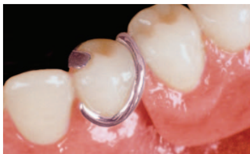
Visible metal makes a beautiful smile less appealing.

To restore missing teeth, one of the typical solutions your dentist may offer is a metal and acrylic partial denture. While these restorations replace your missing teeth, they unfortunately have metal clasps that can be seen when you smile. Visible metal is unsightly and unnatural in an otherwise beautiful smile.