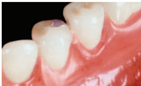
Valplast is attractive and blends with your smile.

Valplast is an advanced solution for the replacement of missing teeth. It is based on modern thermoplastic technologies. Unlike metal, Valplast blends naturally with your teeth and gums, enhancing the appeal of your smile.